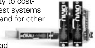
DigiTest Centralized Test System

For DSL, DigiTest can also detect load coils, measure loop length and predict bit rates.