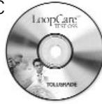
LoopCare Test OSS

The Lucent-recommended LTS replacement product is Tollgrade's DigiTest® Centralized Test System. DigiTest is approved for use in each RBOC and is the only test system fully backward compatible with the LoopCare™ Test OSS , already widely in use in all of the RBOCs. LoopCare is responsible for hundreds of millions of automated tests on a majority of the more than 167 million ILEC subscriber lines each year. 1 In addition, DigiTest uses the same Operation, Administrative and Maintenance (OA&M) tools as the LTS, so the same people that administer LoopCare today for LTSs can easily transition to manage DigiTest.